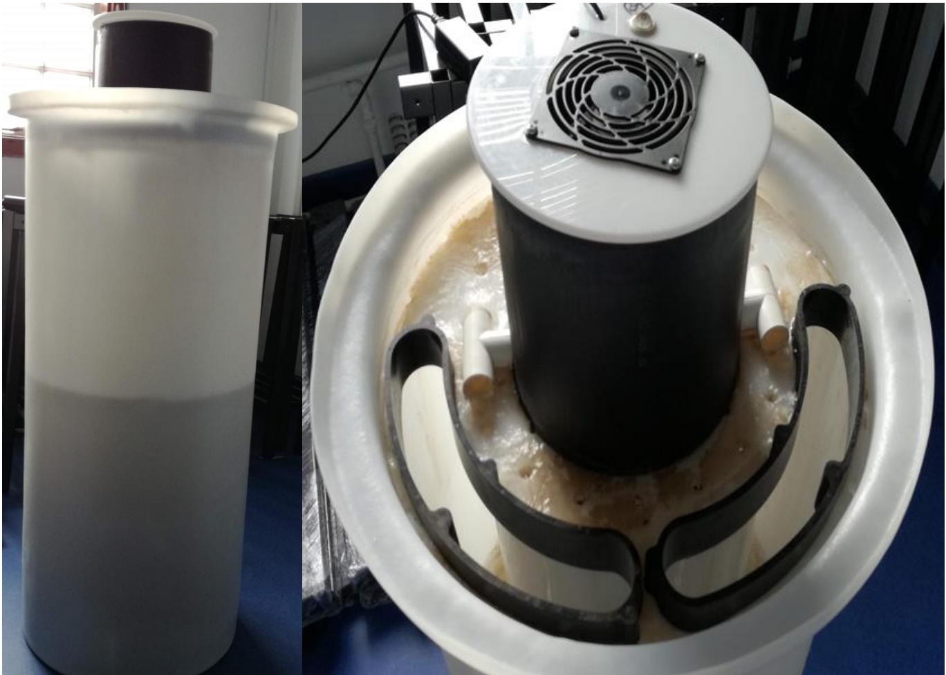
Figure 2 Photographs of the AWE 300 device

Noise: The average 8 hour equivalent noise level when the device was off, was 43.3dBA and 66.5.8dBA when the device was on, which is above the noise levels reported by the supplier of 40db. These readings would need to be compared to the recommended maximum allowable sound level (without hearing protection) at varying exposure times in different settings depending on where the device is used.